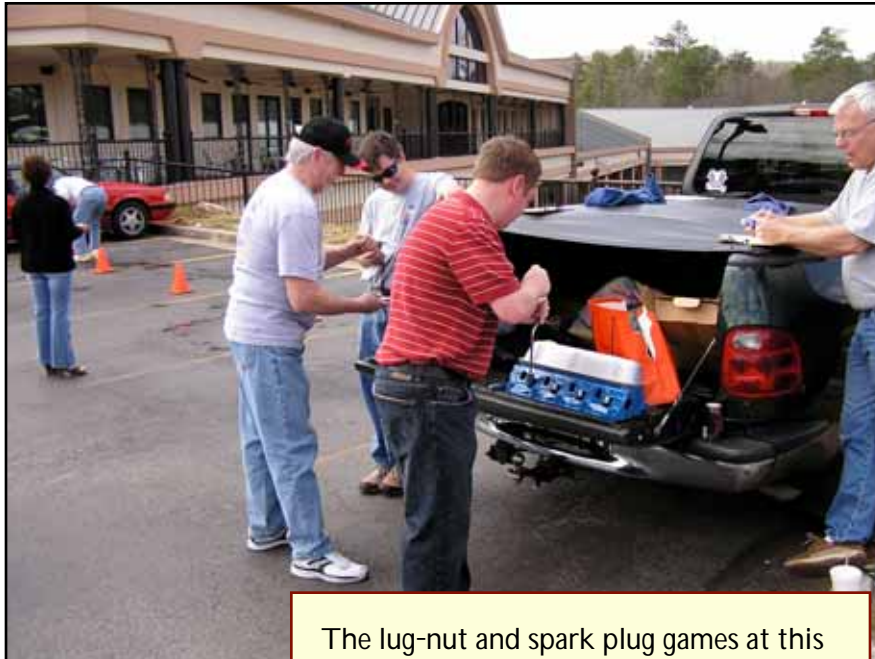
The lug-nut and spark plug games at this month's meeting